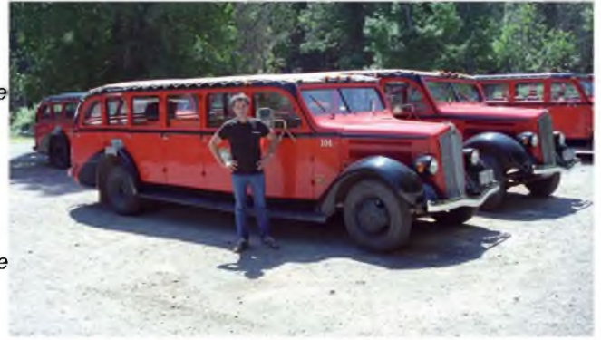
It's a good thing he took good care of it!