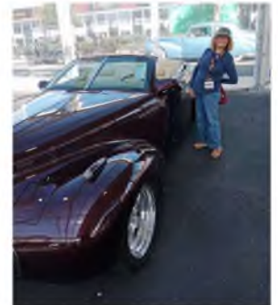
No, I'm not posing with the Blackhawk. I stepped into a hole in the field and turned into a question mark!

The prices paid were outrageous. The 1965 Shelby GT350R Prototype, chassis 5R002, "Flying Mustang", achieved $3,750,000 as the top result. No less spectacular was the $1,430,000 paid for the 1936 White Model 706 Glacier National Park Tour Bus. (Editor's note: See Page 10 for a flashback)