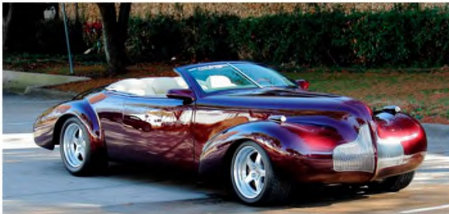
The one-of-a-kind 1996 Buick Blackhawk drew an impressive $385,000 winning bid!