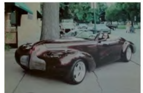
Right: Many years ago I actually got sit in the Blackhawk. Cool! But not as cool as the actually driving it . . . RV?