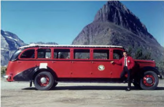
Left: Bill with bus #104 circa 1965

Bill Schoening - BDE #51 drove a 1936 White tour bus in Glacier Park summers for a couple of years when he was in college around 1965.